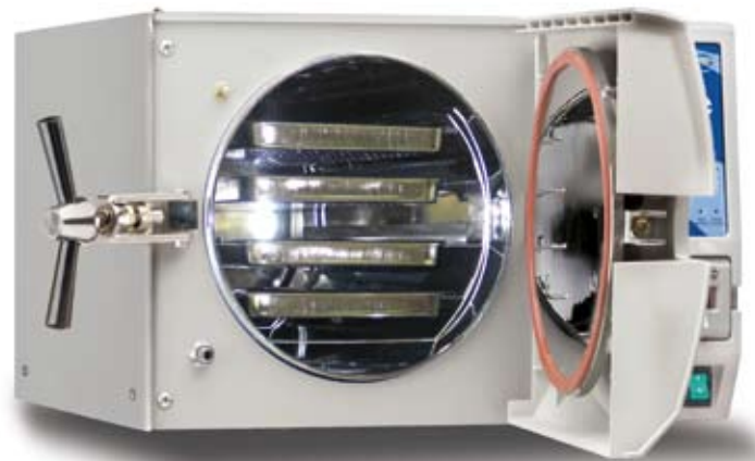
EZ10 with 4 large trays

* Above photo shown with optional printer