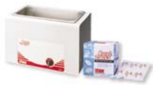
Clean&Simple™ Ultrasonic Cleaners and Tablets

Documents: date, time, temperature, pressure.