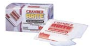
Chamber Brite Autoclave Cleaner